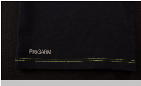
Double stitching for longevity