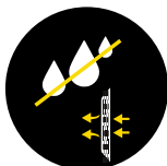
WATER RESISTANT & BREATHABLE