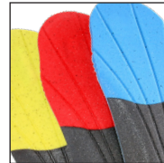
Vario Wide Fit System