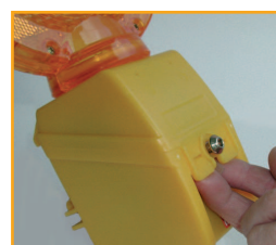
Open using NiKo key

12 lamps c/w plastic cone bracket in one carton / 240 lamps on one pallet