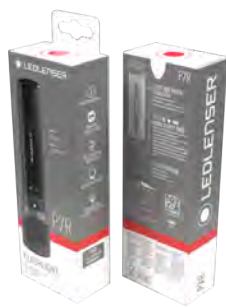
For illustration purposes only