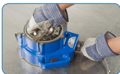
A. Pull entire length of cable out and activate lock to prevent rewinding.