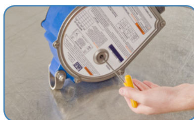
B. Loosen original cable termination and remove lifeline assembly.