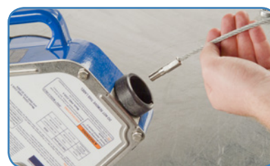
C. Insert new lifeline assembly and secure in place. Restrain lifeline, release lock and allow new lifeline to retract.