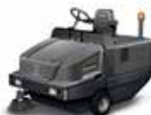
Ride-On Vacuum Sweeper