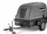
Hot Water Pressure Washer Trailer