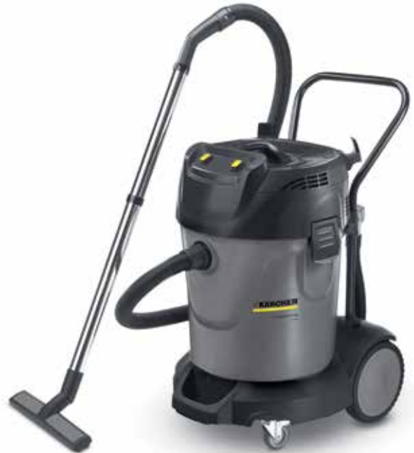
Model shown: NT 70/2