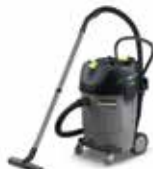
65 Litre AP Class Wet & Dry Vacuum Cleaner