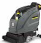
Walk-Behind Scrubber Drier