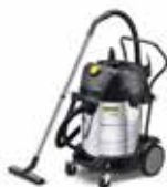
75 Litre TACT Class Wet & Dry Vacuum Cleaner