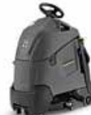
Step-On Vacuum Cleaner