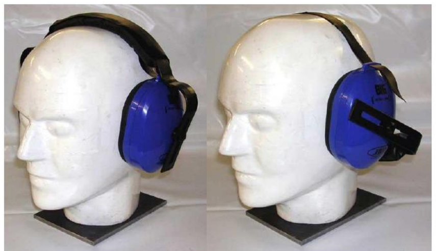
Fitted Behind The Head