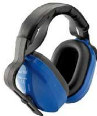
Fitted Over The Head