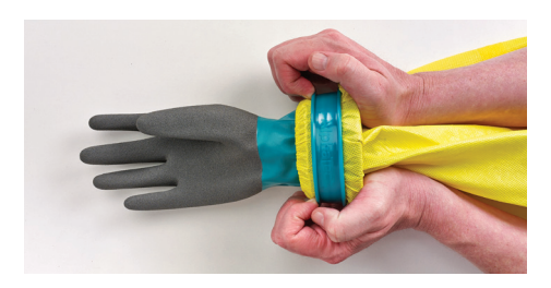
Step 7 - Using both hands push the AlphaTec* ribbed green collar further up the sleeve until tightly locked in position. Ensure outer ring is tightened as far as possible to provide a secure fit.