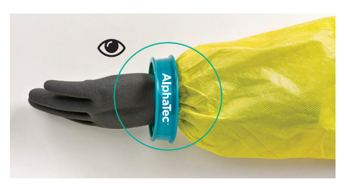
Step 5 - Pass the glove through the AlphaTec* green outer ring. Note ring orientation - the logo on the ring needs to be as shown above.