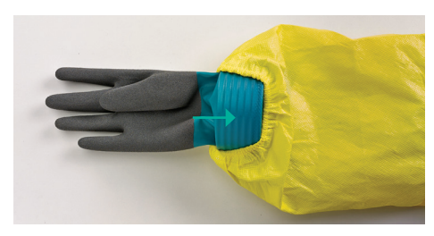
Step 3 - Push the glove with the cone fitted up into the sleeve making sure the cone within the glove is fully covered by the sleeve as shown in step 4. If double sleeve, use the outer.