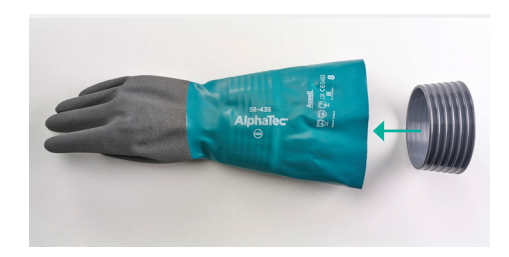
Step 1 - Push the narrow end of the ribbed grey cone into the glove.